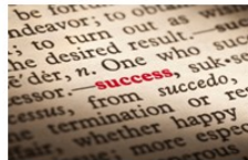
One Card System