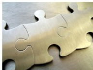
General Financial Services